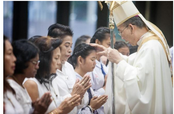
The laying of hands

At your Confirmation, a saint is also chosen to be your heavenly intercessor, helper and protector against evil and to finally welcome you in heaven.