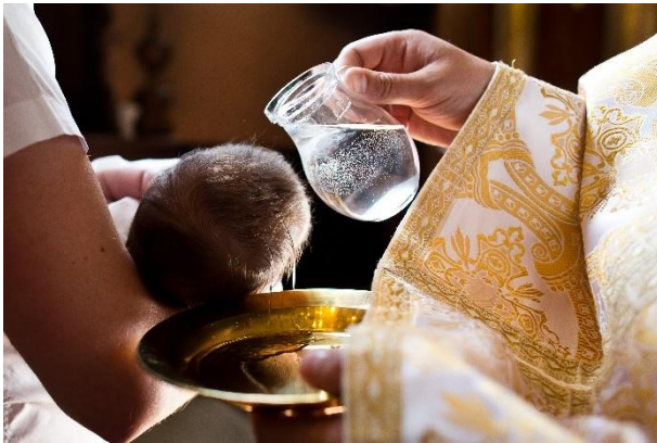
Baptise soon after birth

“One Lord, one faith, one baptism.” (Ephesians 4:5)