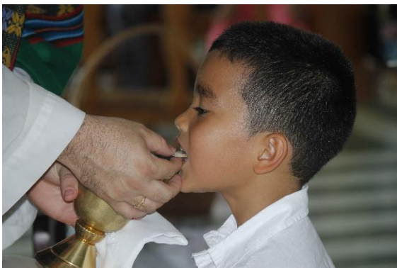
Receive Jesus in the mouth

"Also, as my children enter the church, they must sit in the front as they are coming in, not at the back of the church or scattered like lost sheep. Oh, it pleases my Son Jesus to see his children being united together, not like lost sheep. Come, my people, receive this request from your Father God. Come and sit with my Son Jesus in Holy Mass. My people, as you are arriving, start sitting in front and fill the gaps. My children, when you invite your guests, friends, to